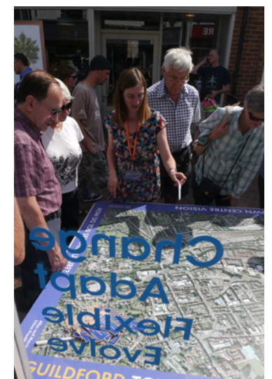
Photos taken at the exhibition presenting the Draft Guildford Town Centre Vision at Swan Lane on 25 and 26 July and 12 September