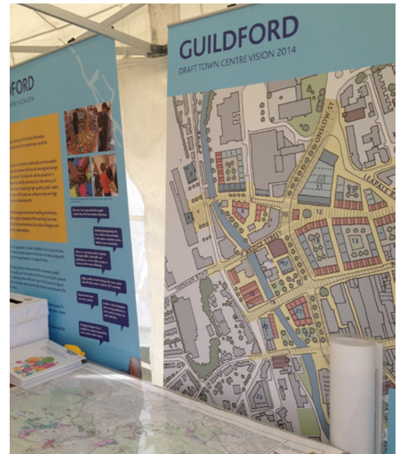
Photos taken at Guilfest, one of the other events that was attended by Allies and Morrison Urban Practitioners