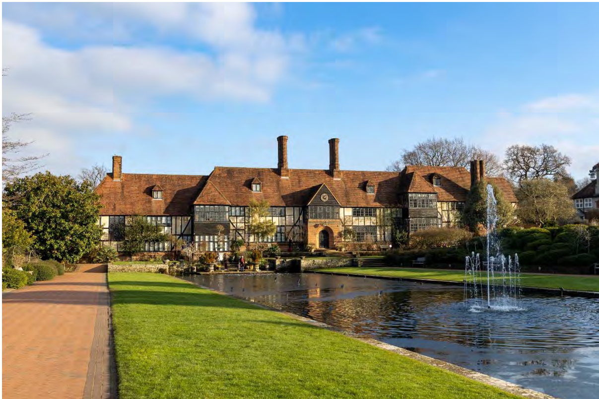
Wisley Laboratory 2023