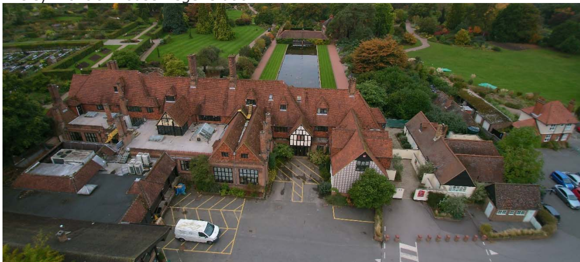
Wisley Front of House Regeneration