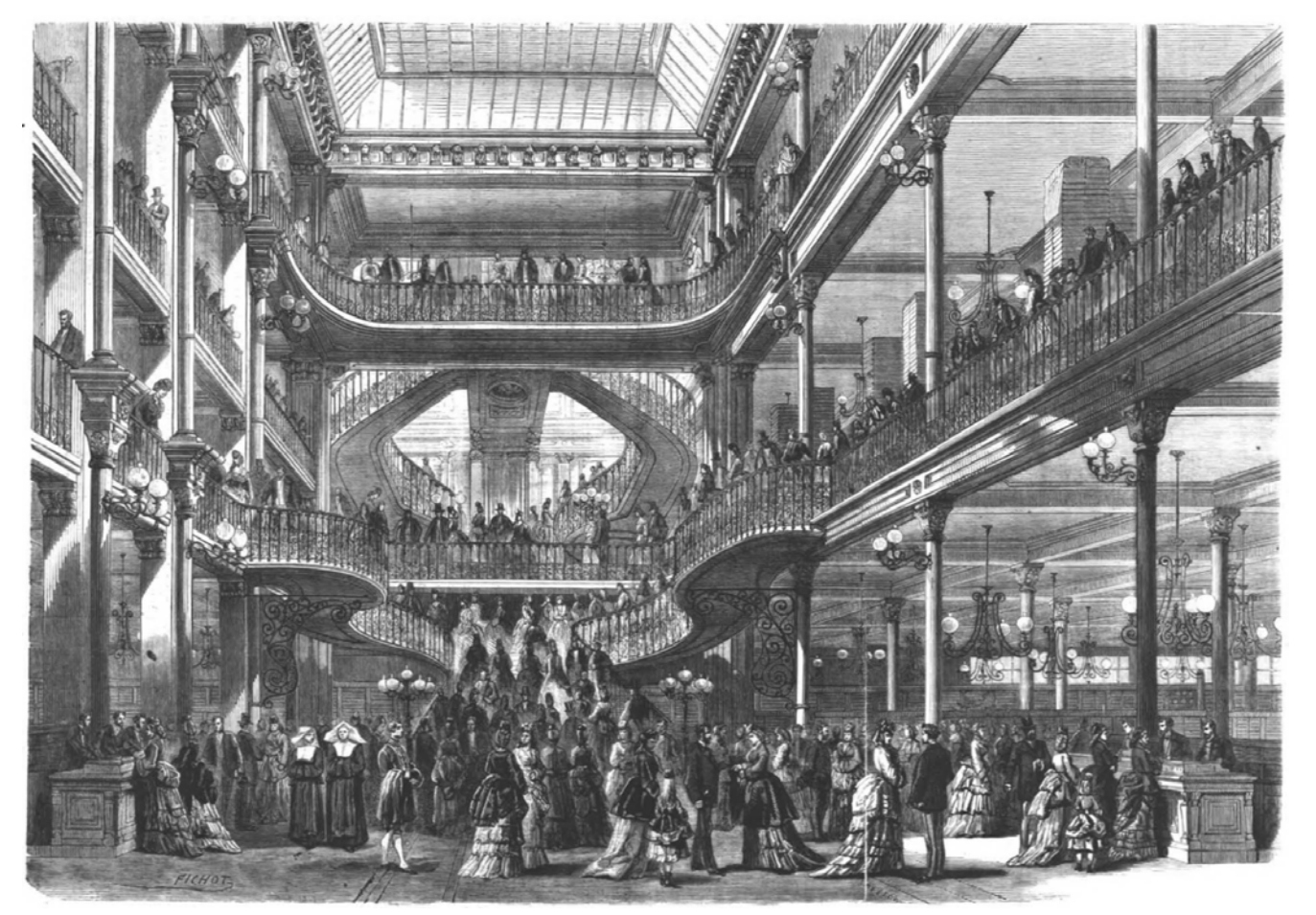
Le Bon Marché in Paris, Charles Fichot, 1872

In 1796 Harding, Howell and Co's Grand Fashionable Magazine opened on Pall Mall, described by an enthusiastic observer as "perfectly unique in its kind". The store was 150ft long, housed in the former residence of a Dutch Duke, and separated into four departments by glazed partitions. Yet it closed in 1820, and it wasn't until the model was ratified in France that department stores truly took root in the UK.