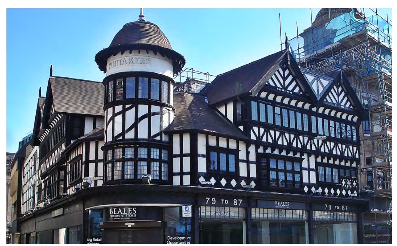
Plucas58, Wikimedia Commons