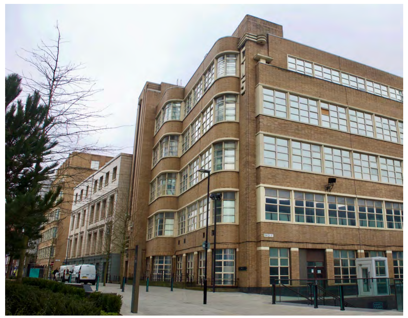
Redfern Building, pictured in 2016

backing a huge regeneration scheme, rebranding the area as NOMA (North Manchester). It includes their recently built HQ at One Angel Square (2013), alongside several other historic Co-op buildings which are to be renovated for various new uses.