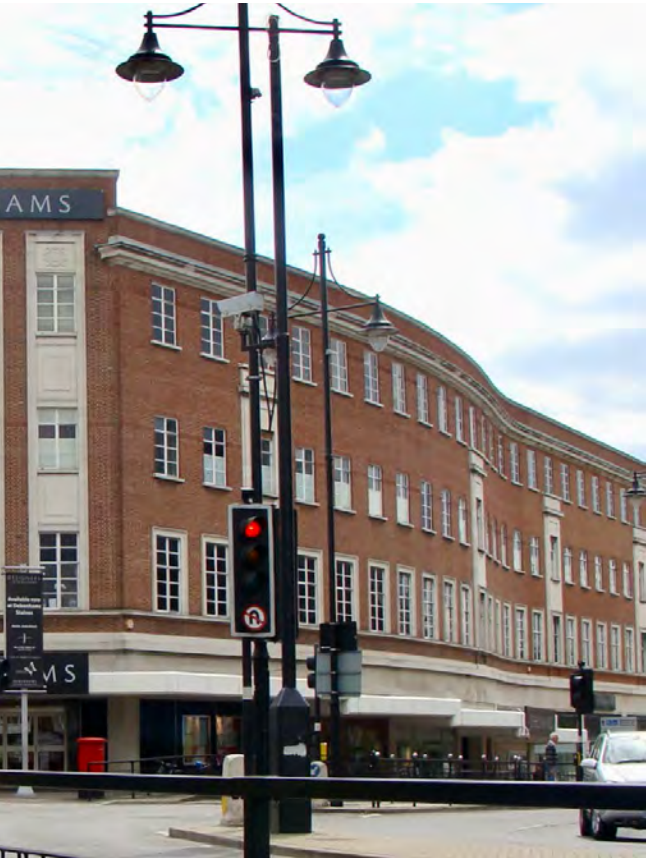
Ruth Sharville, Wikimedia Commons

The present building opened in 1916 after the previous premises burnt down. The designs were by John Caleb Petch, who also designed Boyes' family home in 1897 (adding a garage in 1914 – Boyes was reportedly the first car owner in the town). The Boyes store was to be Petch's final work. Within a modest three storeys, it conveys the glamour of a store in a larger town centre, and selling more expensive items. The upper two storeys are decorated with pilasters and an attractive array of bullseye and round-top windows. There are also a number of balconies with wreathed 'B' emblems. The crowning glory, of course, is the octagonal clock tower, from which there must be a lovely view of the sea.