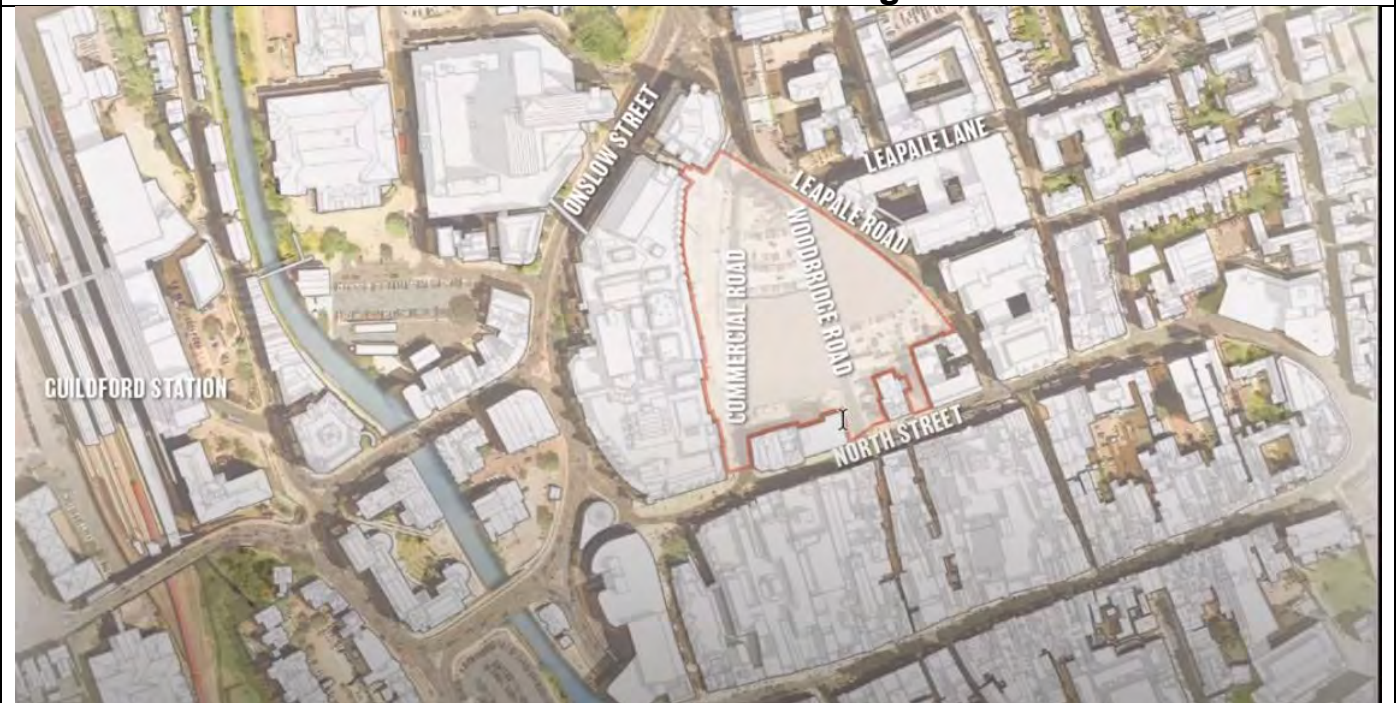
Ownership of the land – M&G retain Subterranean rights on the Sanofi House Car Park under the current Bus Station

The Site outlined in Red – Note the limited frontage on North Street